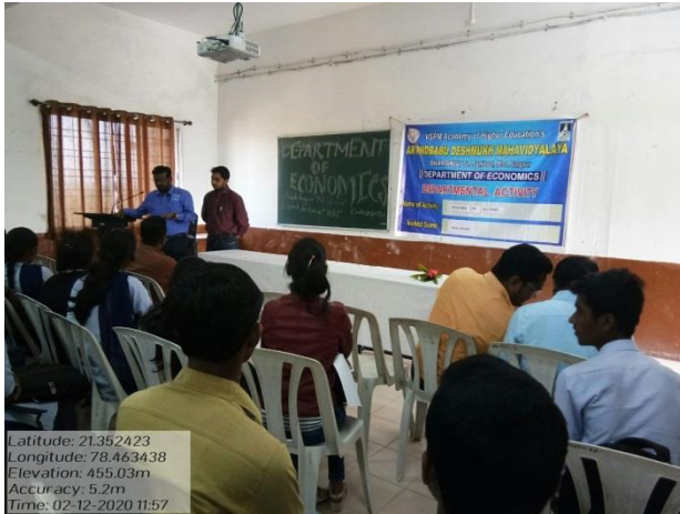
Latitude: 21.352423 Longitude: 78.463438 Elevation: 455.03m Accuracy: 5.2m Time: 02-12-2020 11:57