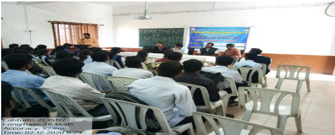
Latitude: 21.35197 Longitude: 78.46315 Accuracy: 92.9m Time: 02-12-2020 11:23