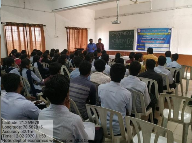
Latitude: 21.269678 Longitude: 78.582815 Accuracy: 32.1m Time: 12-02-2020 11:58 Note: dept of economics workshop on M.L.S Co