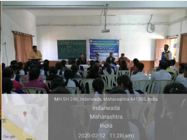
MH SH 248, Indarwada, Maharashtra 441305, India Indarwada Maharashtra India 2020-02-12 11:28(am)