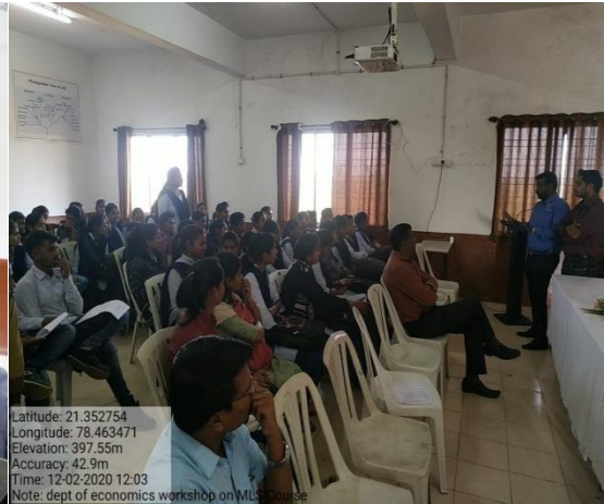
Latitude: 21.352754 Longitude: 78.463471 Elevation: 397.55m Accuracy: 42.9m Time: 12-02-2020 12:03 Note: dept of economics workshop on M.Com course