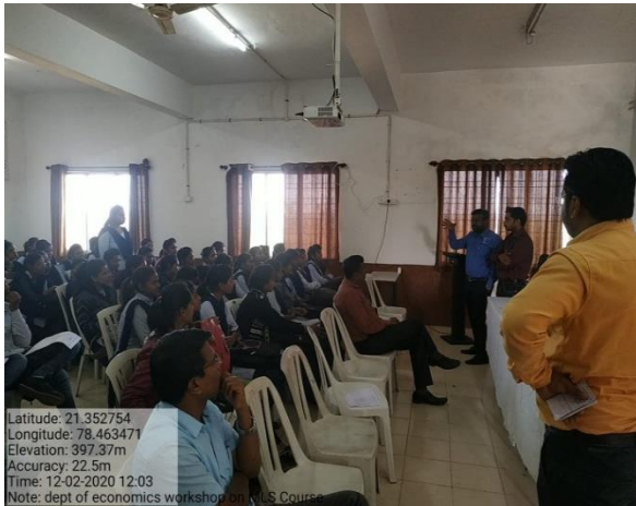
Latitude: 21.352754 Longitude: 78.463471 Elevation: 397.37m Accuracy: 22.5m Time: 12-02-2020 12:03 Note: dept of economics workshop on M.Com course