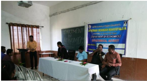
To Panwadi -1.4 Kms., Panwadi, Maharashtra 441305, India Panwadi Maharashtra India 2020-02-12 11:26(am) Google