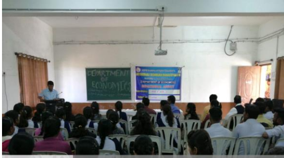
To Panwadi -1.4 Kms., Panwadi, Maharashtra 441305, India Panwadi Maharashtra India 2020-02-12 11:29(am) Google